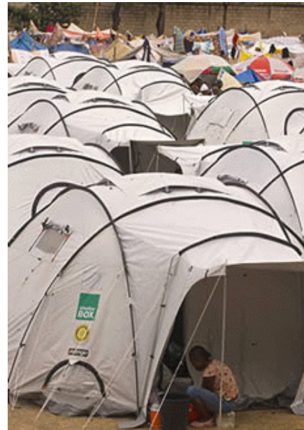
ShelterBox City in Haiti

Since its inception in 2000, ShelterBox has provided shelter and dignity to people in more than 100 disaster situations in more than 60 countries, bringing the organization to the forefront of international disaster relief. ShelterBox instantly responds to earthquake, volcano, flood, hurricane, cyclone, tsunami or conflict by delivering boxes of aid. In many cases ShelterBoxes have made the difference between life and death.